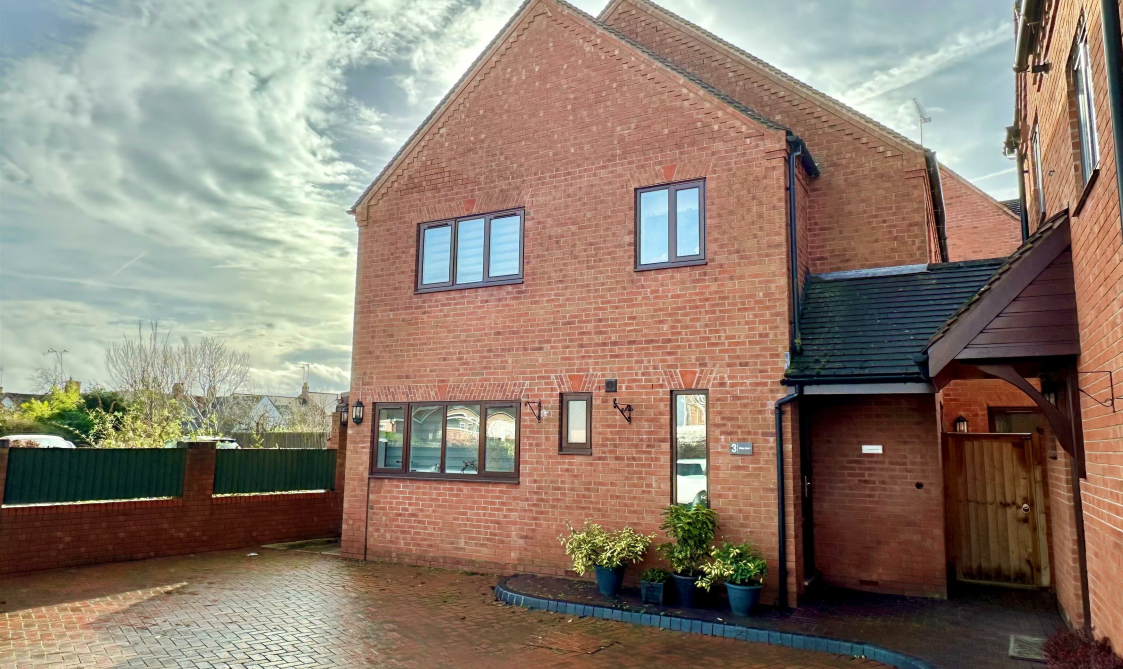
3 Globe Court, Evesham Street Alcester, B49 5BD